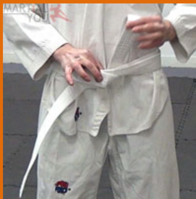
Step 6: Take the end on your left side and tuck it under all layers of the belt and pull it upwards