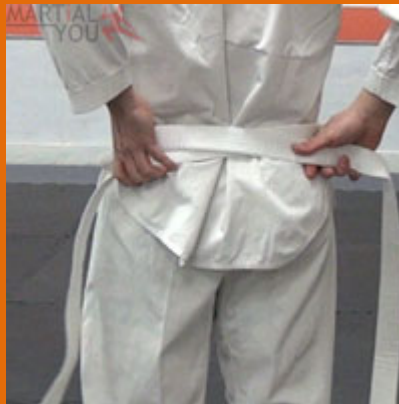
Step 4: Cross the end from your left over the end from your right in the back.