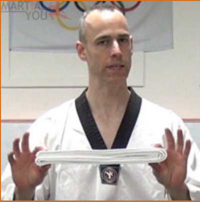
Step 1: Grab the belt!