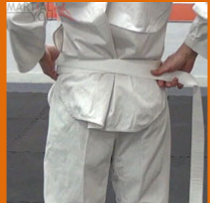
Step 4a: As you bring the belt ends around you and to the front, tuck the left end underneath.