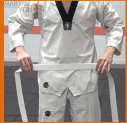
Step 3: With the belt size label facing the inside, place the center of the belt on the front of your waist.