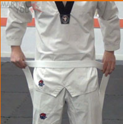
Step 3a: Wrap the belt around your waist and bring each end behind you.