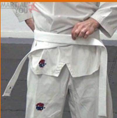
Step 5: When you bring the two ends back to the front of your waist, cross the right over the left